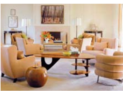
A gold-coloured room

Date: 15 Nov 2009 (Sunday) • Time: 10:00 am to 5:00 pm Venue: 1FengShui.com, 63A, Jalan PU 7/4, Taman Puchong Utama, Puchong, Selangor, Malaysia For more details, please visit www.1FengShui.com or call 03-8060 0868.